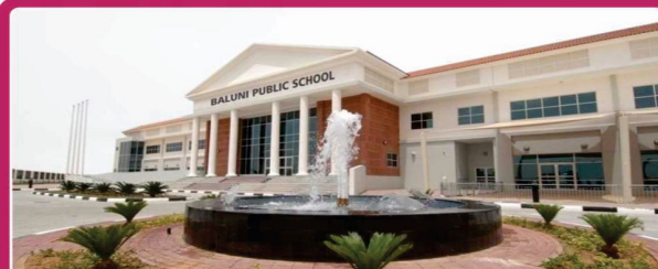
Baluni Public School, Bhauwala, Dehradun