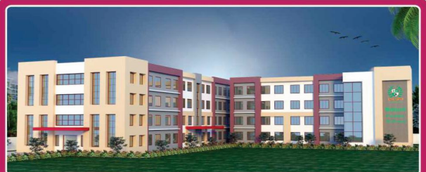
Baluni Public School Shastripuram, Agra