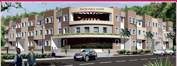
Baluni Public School, Deori Road, Agra