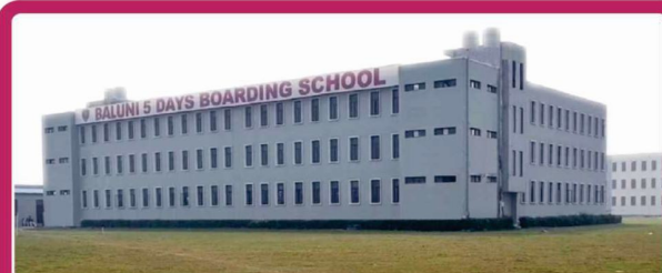
Baluni School of Competition, Farah, Agra