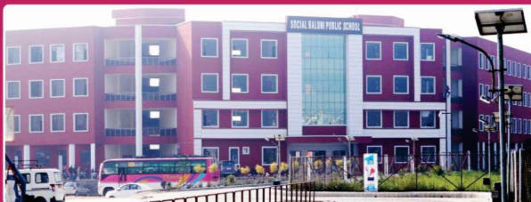
Social Baluni Public School, Dehradun