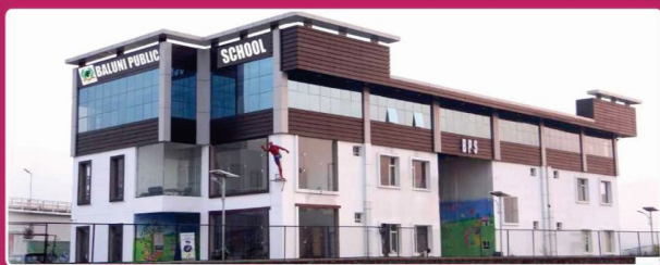
Baluni Public School, Keshowala, Dehradun