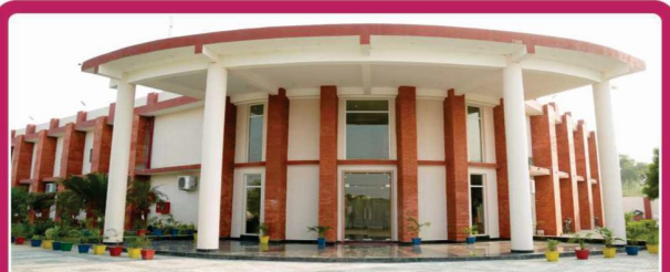
Baluni School of Competition, Khaspur Dayalbagh, Agra