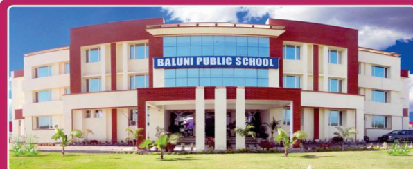
Baluni Public School, BEL Road, Kotdwar (Bijnor)