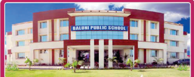
Baluni Public School, BEL Road, Kotdwar (Bijnor)