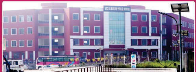
Social Baluni Public School, Dehradun