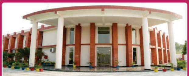
Baluni School of Competition, Khaspur Dayalbagh, Agra