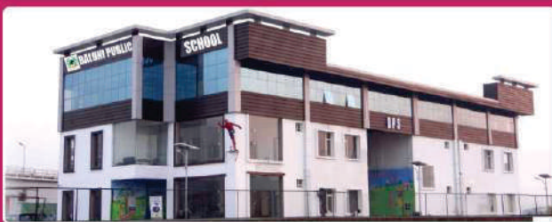
Baluni Public School, Keshowala, Dehradun