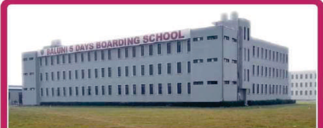
Baluni School of Competition, Farah, Agra