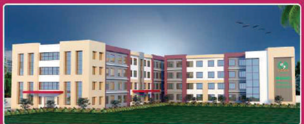
Baluni Public School Shastripuram, Agra