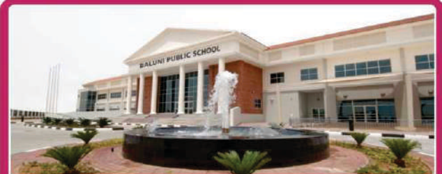
Baluni Public School, Bhauwala, Dehradun