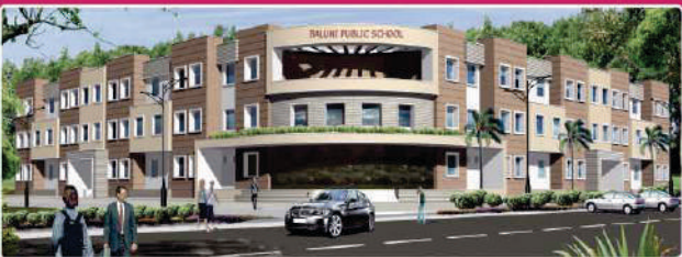
Baluni Public School, Deori Road, Agra